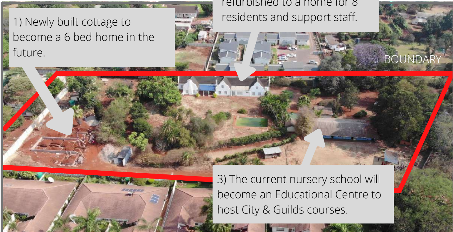
Aerial view of the Harbour House Hub. The property is surrounded by established cluster homes.

3) The current nursery school will become an Educational Centre to host City & Guilds courses.