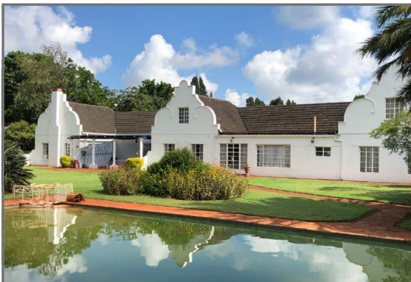
Harbour House before the refurbishments to become a home for 8 residents.

"It is during the worst of times, that the best things can be achieved."