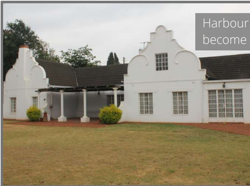
Harbour House prior to renovations to become an 8 bed home.