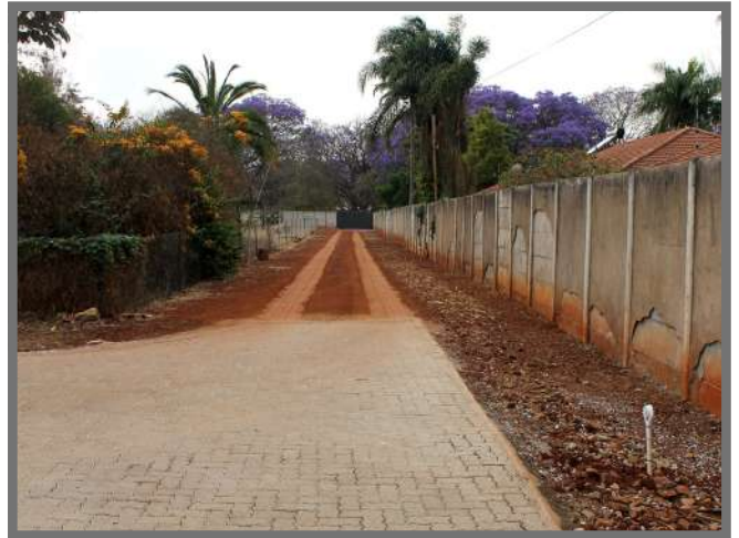
Driveway to the cottage (future 6 bed home) complete and awaiting landscaping.