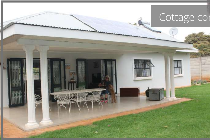
Cottage complete (future 6 bed home).