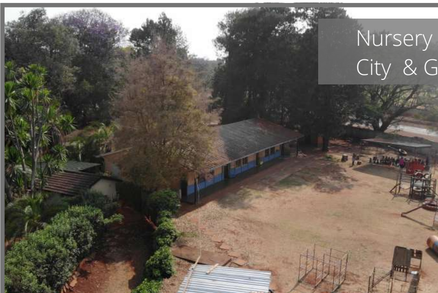
Nursery school to be converted to a City & Guilds Education Centre.