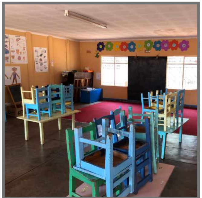
Inside the nursery school to be refurbished for the City & Guilds Education Centre.