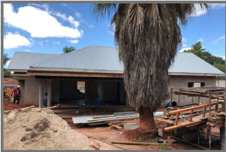
New Cottage building began October 2019 and now complete (future 6 bed home).