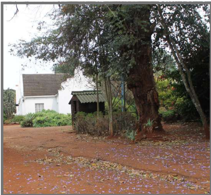
Harbour House main house driveway (future 8 bed home) still to be repaired.